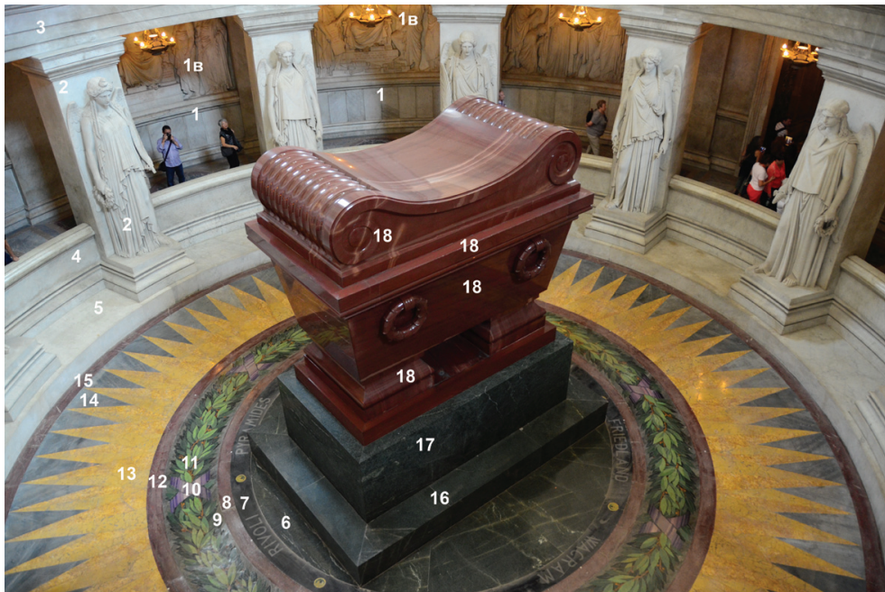
Fig. 1. The crypt and the tombstone of Napoleon

1–5 — Carrara white marbles; 1b — Bas reliefs by P.-Ch. Simart; 2 — Statues by J. Pradier; 6, 16, 17 — Mont Thillet (Ternuay, Vosges) green andesite; 7 — black marble “ St Lucie ”; 8, 10, 12 — red marble “ Griotto ”, presumably from the Pyrenees (Campan); 9, 11, 13 — white marbles incusted with small colored enamel plates; 14 — Grey marble, presumably “ Lunel Fleury ” (Boulogne, Northern France); 18 — Purple Shoksha (Russia) quartzite