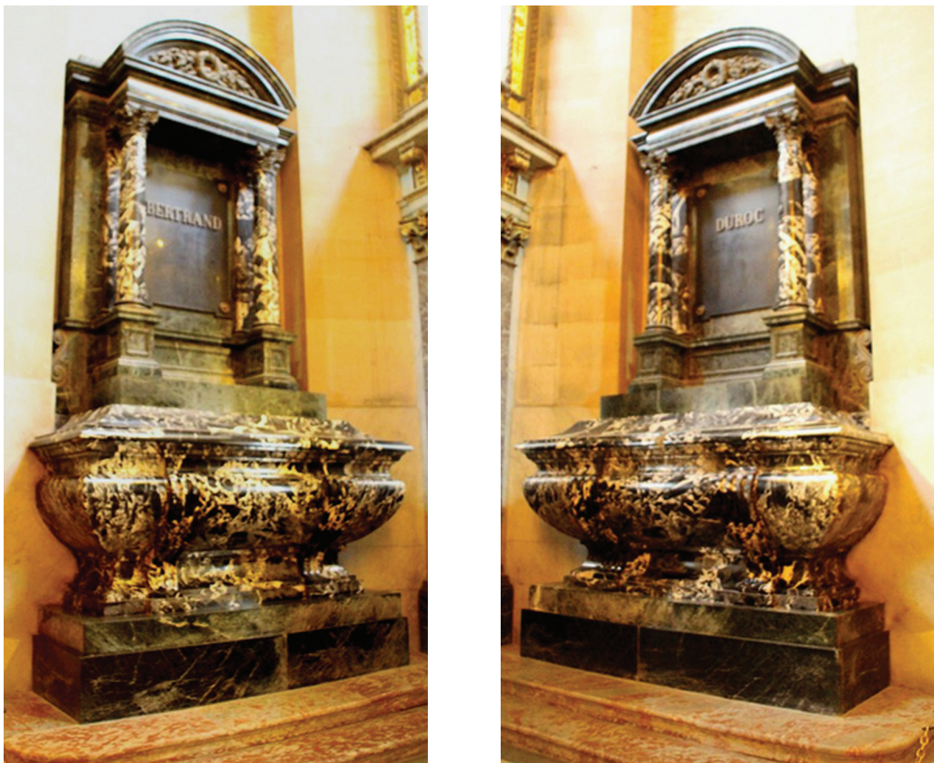
Fig. 2. The Tombstones of Bertrand (left) and Duroc (right) Marbles “ Grand Antique ” (columns and tombs), “ Brèche Napoléon ” (bases of the columns and the top of the tombs), and the black marble is presumably “ St Luce ” (plates with the names)

Among the critics that Visconti had to face about his projects, some did concern the lines of sarcophagus to be too simple. Visconti replied that the simplicity of the lines was balanced by the preciousness of the materials, and he devoted indeed much energy and much money to selecting the best possible materials. A brilliant ‘ Ingénieur des Mines ’, Louis Etienne Héricart de Thury (1776–1854) had been asked in 1810 by the Napoleonic administration to make an inventory of all quarries active on the French territory [13]. It served as a basis for sending letters to Prefects of all departments, asking them if they could find on their territory any rock, which could be used for the monument. The quest was successful for colorful marbles, indeed well represented in many parts of France (the Pyrenees, Alps, Languedoc, Northern France). Two varieties were selected by L. Visconti to make the altar and the entry to the crypt.